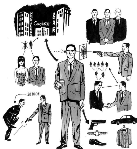
Siniša Labrovic, Postgraduate Education Manual , 2009. Original drawings by Igor Hofbauer