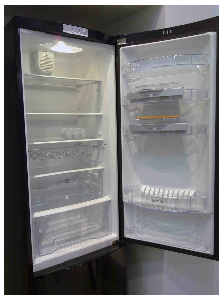
Open smart fridge (2) photographed by smart fridge (1)