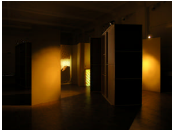
Karina Nimmerfall, SECOND UNIT: MIAMI, 2006. Walkable 2 channel space-video installation