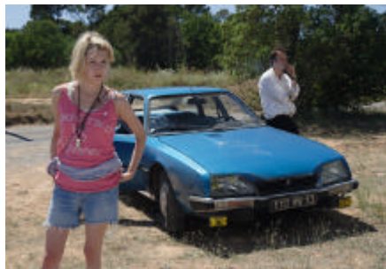
Isabell Heimerdinger, DETOUR, 2007. production still 16mm color film, optical sound, 10 min., Galerie Mehdi Chouakri, Berlin

2008 "Vertical Villa", Galerie Stadtpark, Krems 2007 "Power Play", Landesgalerie Linz 2006 "Double Location", Bucket Rider Gallery, Chicago